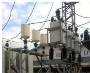
HV CAPACITOR BANK