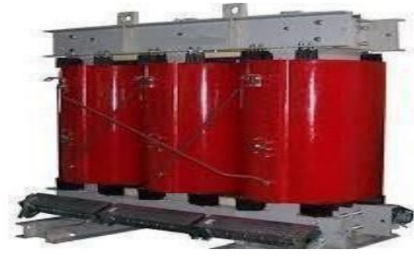
DRY TYPE TRANSFORMERS