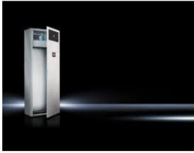
RITTAL MAKES CUBICALS