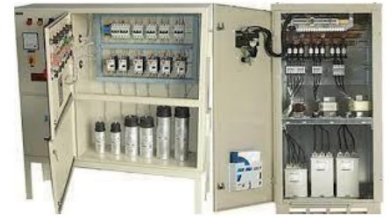
LV CAPACITOR BANK