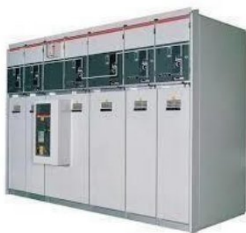
11&33KV RINGMAIN MANAGEMENT UNIT(RMU)